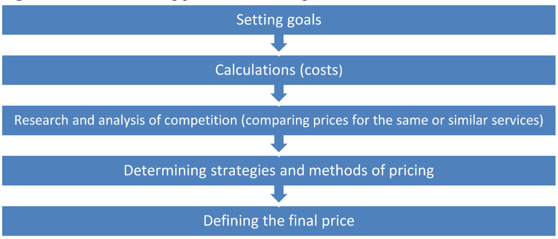
Figure 2. Decision making process of defining costs

Source: Mihajlović & Kostić (2005), p.14.