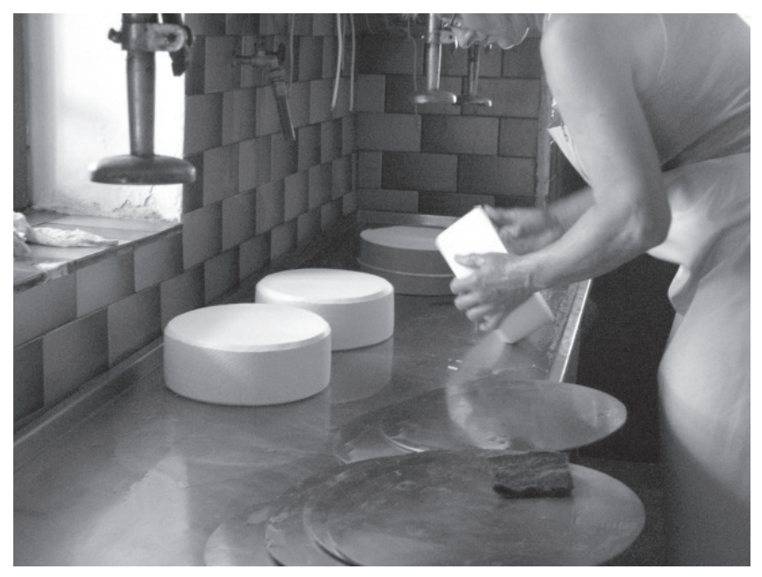
Picture 3: Marija Gaberšček turning round cheeses, Pretovč alp. Photo by: Špela Ledinek Lozej, 2011.

to keep under control and therefore do not always yield the expected results (Čotar 1988:43).