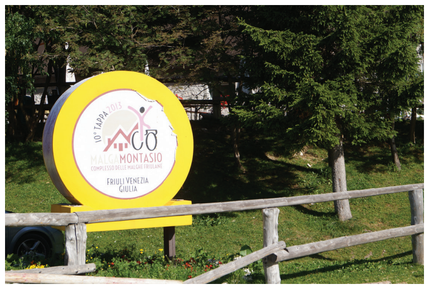
Picture 1: Promotion of the Montasio cheese in the Montasio alp. Photo by: Špela Ledinek Lozej, 2016.

The cheeses produced in the Slovenian part of the Julian Alps and awarded a PDO are the Tolminc (Regulation (EC) No 187/2012), the Bovec cheese (Regulation (EC) No 753/2012) and the Mohant cheese (Regulation (EC) No 1163/2013). As opposed to the large number of producers of the Montasio cheese, there are surprisingly few producers of PDO-labelled cheeses in Slovenia. In 2016 there were three producers of the Tolminc cheese, three of the Bovec cheese, and five of the Mohant cheese (Field notes,