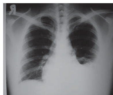
Figure 1. Plain chest radiograph with increased opacity along the left lower hemithorax and blunting of the costophrenic angle.

Most traumatic diaphragmatic hernias are symptomatic within two weeks of occurrence. The major reasons for delay in symptoms in the patient described herein may have occurred due to the temporary "plugging" of the diaphragmatic defect by the omentum, which was not able to prevent symptomatic visceral herniation from occurring months later. (15) A significant penetrating injury of the diaphragm is often undetected within 24 hours and thoracic radiographs of these patients are frequently normal. Strangulation of bowel occurs as much as 80% of the