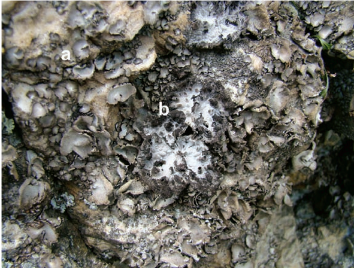
Fig. 3. Umbilicate lichens at the locality »Tauberove stijene«: a) Umbilicaria hirsuta , b) Lasallia pustulata (photo: S. Ozimec, 9 May 2010)

the intensive shelterwood-cutting is based on a progressive thinning of even-aged trees, and it is concluded in ca. 100-120 years. In the past, sizeable final clear-cutting was done up to 70 years ago, with an intensity of 260 ha/year, while during the last 20 years the intensity was reduced to 100 ha/year (SAMARĐIĆ, 2005). Since commercial forests make up 89% of total forest stands, dominance of beech and sessile oak trees, and the rotation period of 100 years, further final clear-cutting is planned for the next 20–30 years.