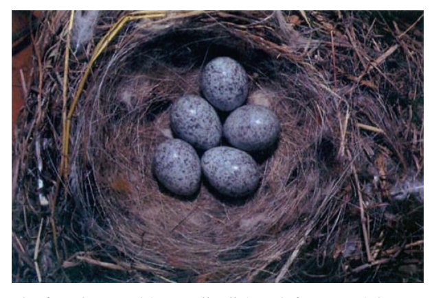
Fig. 2. Clutch of pied wagtail ( Motacilla alba ) with five eggs