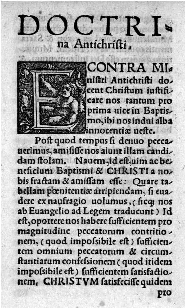
Breues Symmae Religionis Iesu Christi, & Antichristi. Bayerische Staatsbibliothek, München.