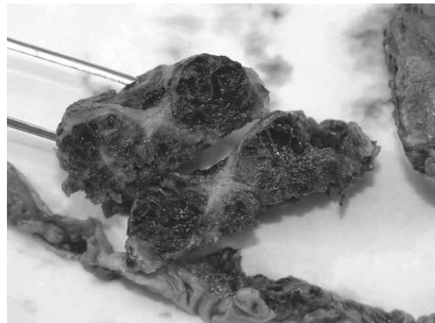
Fig. 2. Surgically removed specimen; the brown multilobulated, softly tumour tissue mass.

A total body radioiodine (I-131) scan didn't detect activity. A follow-up cranial CT scan showed no tumour recurrence. Ten months later patient's general condition remained well.