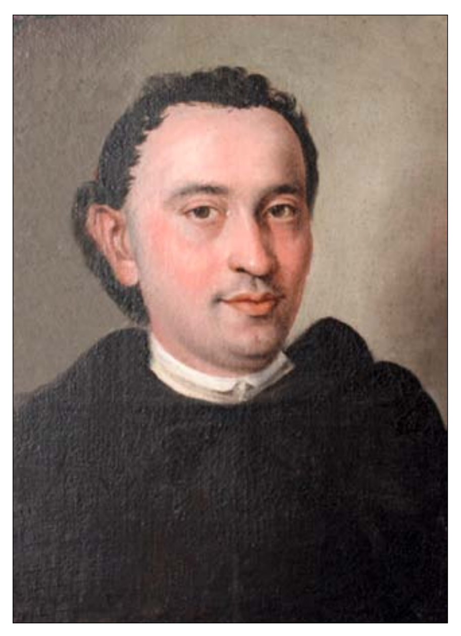
Fra Vitale de Santis of Ravenna, (1736 – 1803) - the last pharmacist in the Dominican pharmacy in Dubrovnik.

Fra Vitale de Santis iz Ravene, (1736.–1803.) – posljednji ljekarnik u Dominikanskoj ljekarni u Dubrovniku