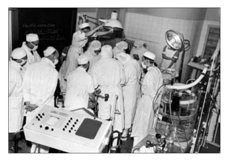
Figure 2 Preliminary experimental team work on dogs in 1957 before the first open heart operation in Ljubljana