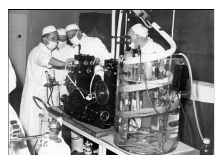
Figure 4 The 1957 Slovenian cardiopulmonary bypass machine, also known as the "heart-lung machine." It was made at a time when purchase abroad was impossible, and was thus the result of Slovenian expertise and efforts.

Slika 4. Slovenski aparat za izvantjelesnu cirkulaciju iz 1957, poznat i pod nazivom"srce-pluća aparat". Aparat je simbol slovenske stručnosti i napora budući da je izrađen u vrijeme kada je nabava instrumenta u inozemstvu bila nemoguća.