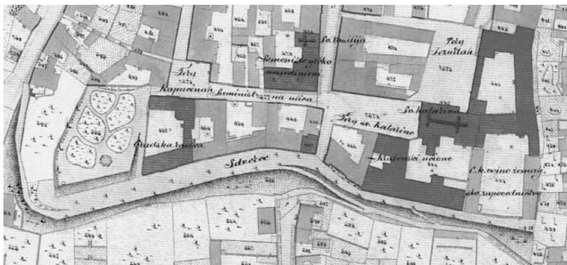
Figure 3 Southern Promenade (today's Promenade of Josip Juraj Strossmayer) on the cadastral map from 1862

was planted and benches were placed along with the street lamps and in the tower, which stood by the gate, a café was built 15 . The final promenade was realised on the basis of the voluntary contributions from citizens. All works were supervised by Bartolomej Flebinger who had previously worked on the arrangement of Maksimir.