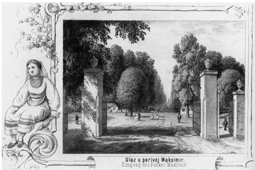
Figure 2 Entrance to Maksimir Park (drawing from 1861)