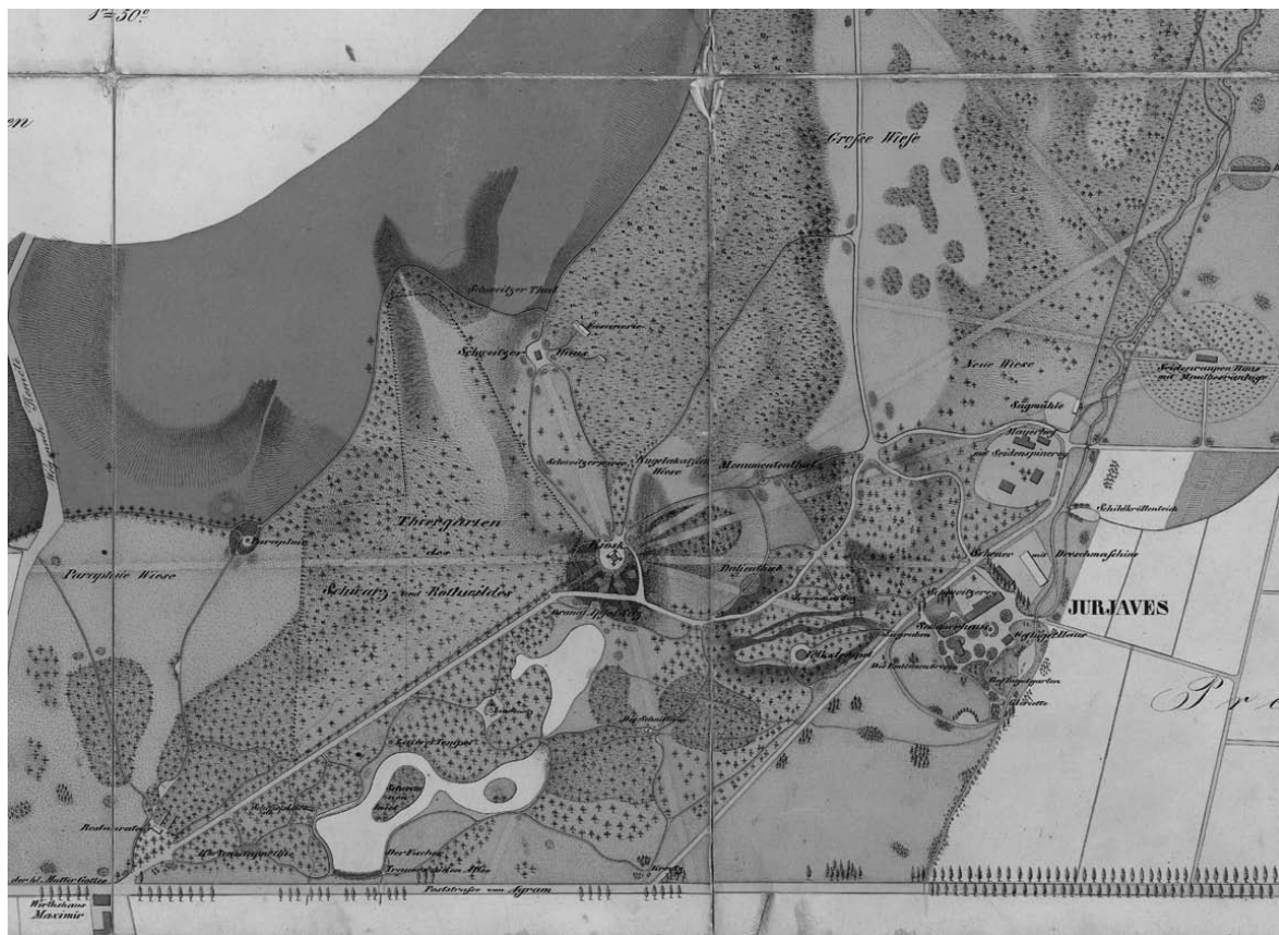
Figure 1 Plan of Maksimir Park from 1846 on which can still be seen traces of the original French concept of the park

arranged in Munich and when architect Izidor Canavale was making a plan for organising an English style park in Laxenburg (in 1783). This chronological coincidence is no coincidence. Many of that time's Croatian builders, engineers and other leaders went to school in Munich and Vienna and, after their return to their homeland they implemented their knowledge and experience acquired in Central European cultural circles.