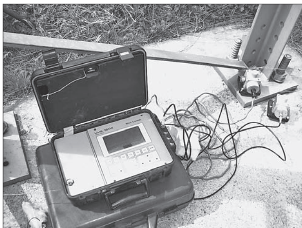
Figure 1 Installation of seismograph and seismic detectors before rock blast on the steel construction of transmitter

Digital fourchannel seismograph UVS 1504 and seismodetectors by Swedish company Nitro Consult (Figure 1) were used for measurement of seismic effects.