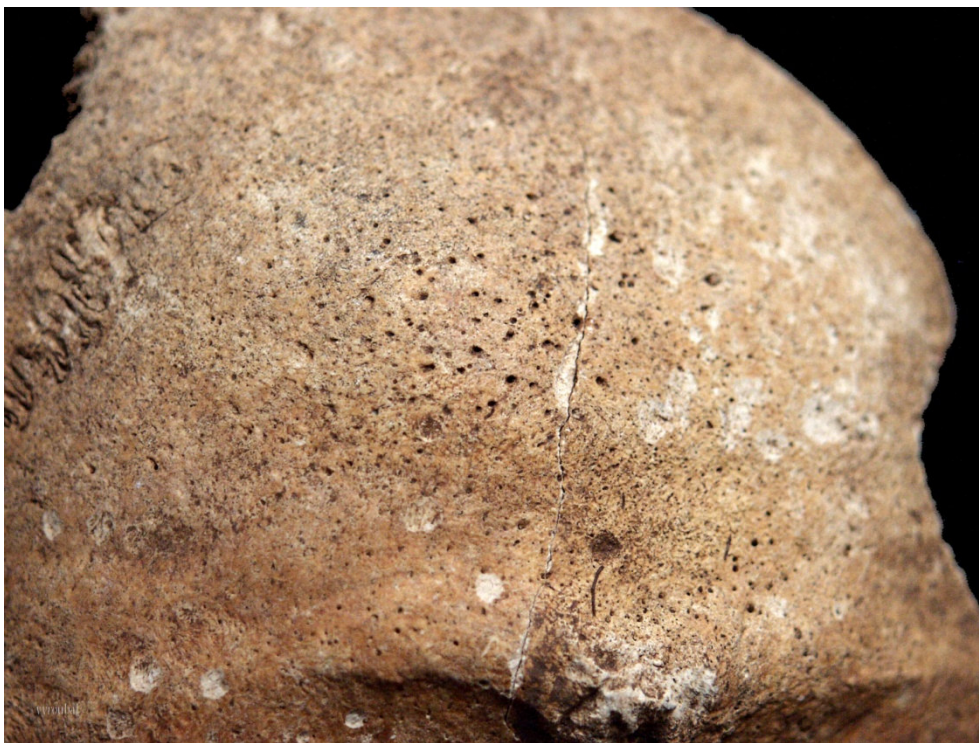
Figure 7 Healed porotic hyperostosis on the occipital bone; Veliki Vanik, grave 3, male