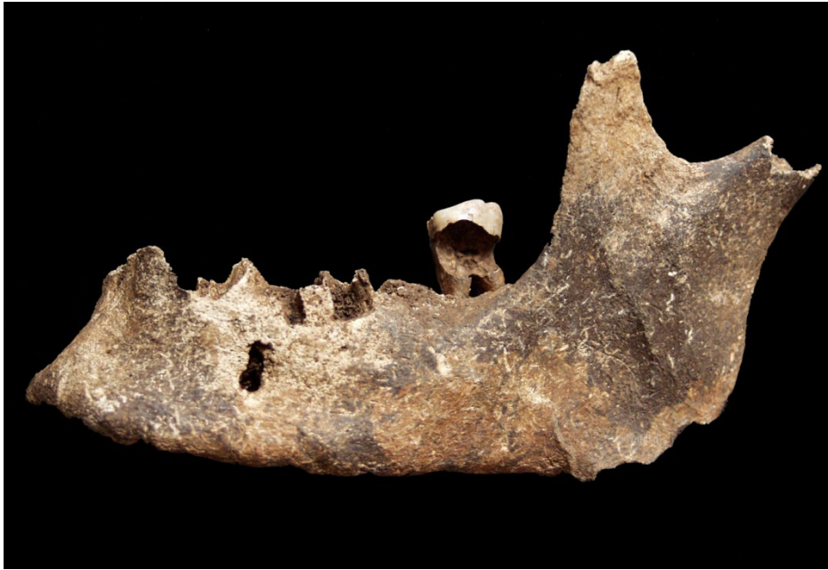
Figure 4 Caries on the left mandibular M3; Veliki Vanik, grave 2, individual B, male