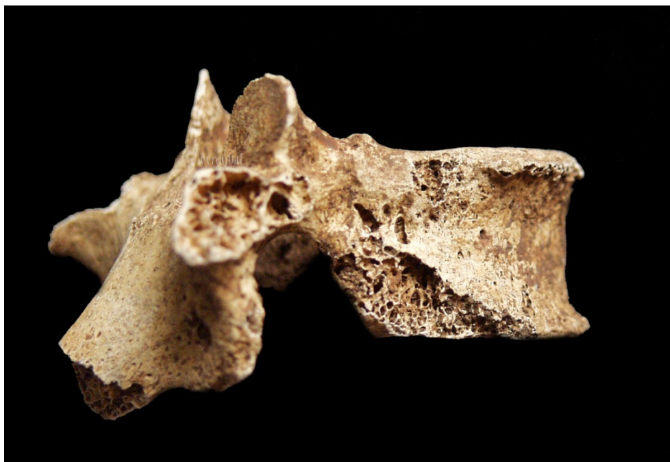
Figure 8 Degenerative osteoarthritis (osteophytes) on the thoracic vertebra; Veliki Vanik, grave 3, male (photo by Vyroubal V., 2011)