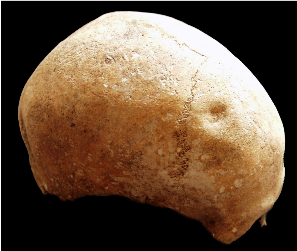
Figure 6 Antemortem healed fracture of the frontal bone and metopic suture; Veliki Vanik, grave 2, individual C, female