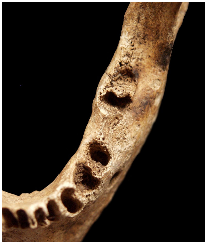
Figure 5 Antemortem tooth loss of the left mandibular M1; Veliki Vanik, grave 2, individual C, female