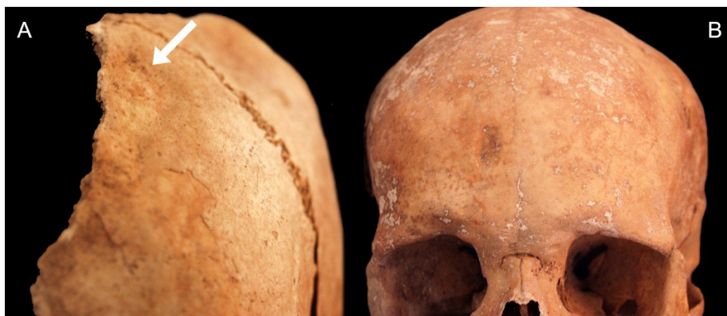
Figure 2 A: Antemortem healed fracture of the frontal bone and metopic suture; Matkovići, grave 1, individual B, subadult. B: antemortem healed fracture of the frontal bone and metopic suture; Matkovići, grave 2, male

An approximate height of an adult female buried in grave 4 from Veliki Vanik was determined based on the maximum femur length: she was approximately 155.6 cm tall.