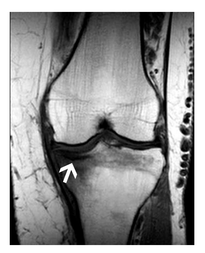
Fig. 2. Fracture of proximal tibia (arrow).

hip and metatarsal bones<sup>5-7</sup>. Tibial stress fractures are often encountered in young military and athletic individuals. In elderly people, they have been reported in association with various rheumatologic conditions but rarely with severe osteoarthritis of the knee<sup>3</sup>. Rheumatoid arthritis is a common underlying condition. In 25 rheumatologic patients with insufficiency fractures of the tibia and fibula, Alonso-Bartolome et al.8 found 16 patients with underlying conditions: rheumatoid arthritis in 13, psoriatic arthritis in 2 cases, and systemic lupus erythematosus in 1 case. Elkayam et al.9 report on nine patients with rheumatic diseases diagnosed as stress insufficiency fractures, eight with rheumatoid arthritis and one with polymyalgia rheumatica. Osteoporosis is a common underlying condition, reported in 50%-83% of rheumatologic patients presenting with stress fracture<sup>6,7</sup>. In 2009, Sourlas et al.3 reviewed the English-language literature on tibial stress fractures and found only 31 cases of tibial stress fractures in elderly patients with knee osteoarthritis from 1972 and reported two new cases. All 31 pa-