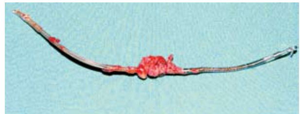
Fig. 2. Vegetation attached to the implantable cardioverter defibrillator lead recorded immediately after surgery.

Like the endocarditis of heart valves, the endocarditis of PM and ICD leads is also diagnosed by the use of Duke criteria; hence, positive blood cultures and vegetation noted on the lead will confirm the diagnosis 3,6 . Our patient was febrile, had a positive blood culture with isolated causative organism from