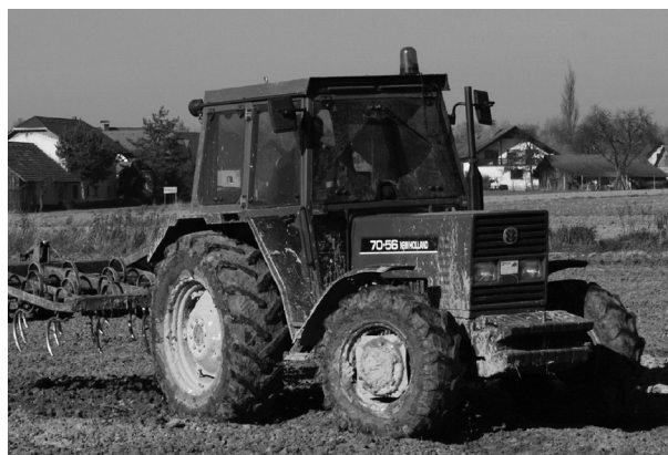
Figure 3. Tractor New Holland 70-56 DT

The working volume of engine is 3613 cm 3 and its output 51,5 kW or 70 HP. It has the four-wheel drive. The mass of the empty tractor is 2950 kg.