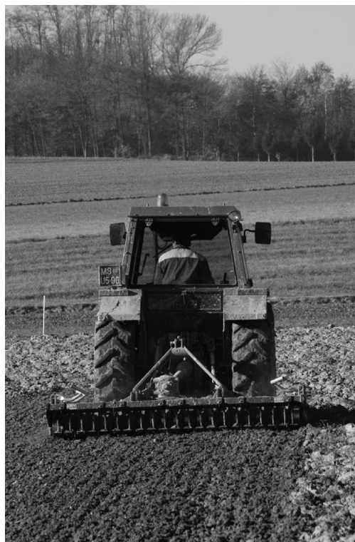
Figure 4. Circular self-cleaning harrow

Figure 4 shows the circular self-cleaning harrow Emy CL 25 used for the test. This is a harrow of 2,5 m working width, 824 kg mass, with 10 pairs of teeth. It is equipped with a Paker roll and is driven through a cardan shaft. During the test the soil was prepared for sowing in one passage at the anticipated speed 6 km/h.