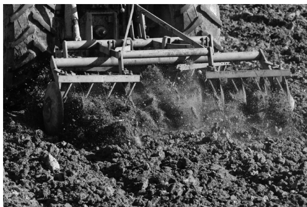
Figure 6. Disk harrow

This harrow has 20 disks distributed on four movable axles of five disks each. For crumbly earth three passages were necessary at anticipated speed 5 km/h.