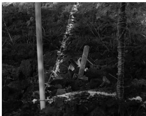
Figure 1. Plot marking