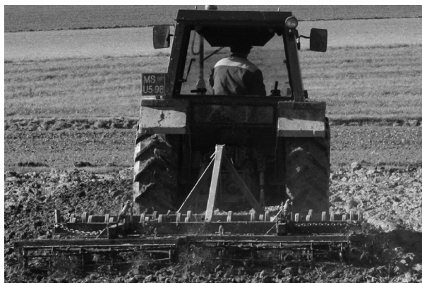
Figure 5. Soil preparation machine

Figure 5 shows the soil preparation machine by Kovastvo Prelog and used for the test. Its working width is 3 m and it is equipped with 20 spring cutters and 4 crushing rolls. The soil was prepared for sowing in two passages at anticipated speed 8 km/h.