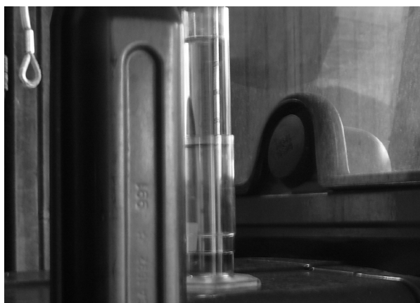
Figure 2. Laboratory measuring cylinder

The fuel consumption was measured by a laboratory measuring cylinder (Figure 2). For each plot the fuel was topped up in the tank prior to beginning of and at the end of cultivation of plot. The reading on the measuring cylinder gave the information about the fuel consumption.