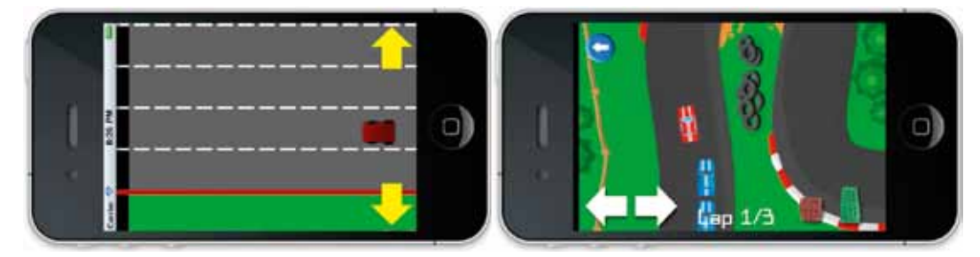
Figure 2 A student racing game in different iterations: basic sprite render and input in 3<sup>rd</sup> week of the course (left image); almost finished game with camera implementation, gestures, and Al in around 12<sup>th</sup> week (right image).