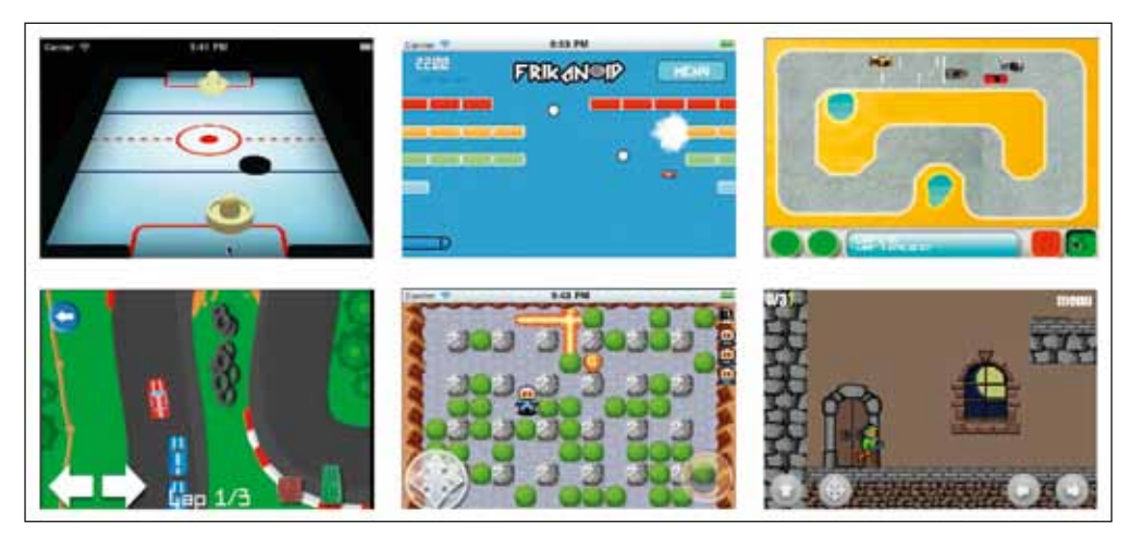
Figure 3 Screenshots of games developed during our computer game development course in the academic year 2010/11.