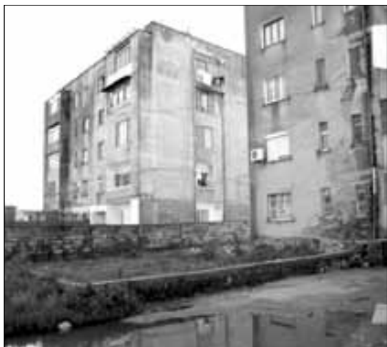
Fig. 4a Evidence of the urban-rural interference Sl. 4a. Primjeri interferencije ruralnih i urbanih elemenata

about land tenure and possession, which remains an open question (Fig. 4 b). Informality is an issue even in the demographic context, as no-one at present can give an exact estimation of the population number in this administrative unit. Equally problematic is the economic informality, notably in the service sector, where many businesses along with their employees are not formally licensed and recorded. So, it seems clear that the challenge of regularizing and integrating the informal character of settlements, economy and demography is of a high priority.