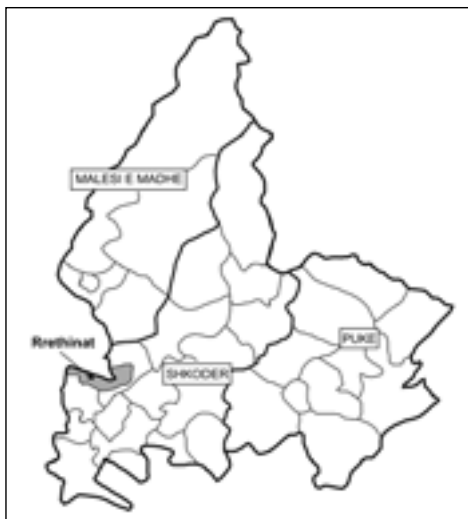
Fig. 1a Location of "Rrethinat" commune on the outskirts of Shkodër city Sl. 1a. Lokacija općine Rrethinat u predgrađu Skadra

constitute it are: 1. Bardhaj, 2. Bleran, 3. Dobraç, 4. Golem, 5. Guç e Re, 6. Grudë e Re, 7. Hot i Ri, 8. Shtoj i Ri, 9. Shtoj i Vjetër, and, 10. Zues. Physio-geographically speaking, this area is predominantly lowland (the altitude varies between 10-388 m). It has a mild Mediterranean climate; it is rich in water resources and has fertile soils which favour their cultivation (Gruda, 1991; Hoti, 1996).