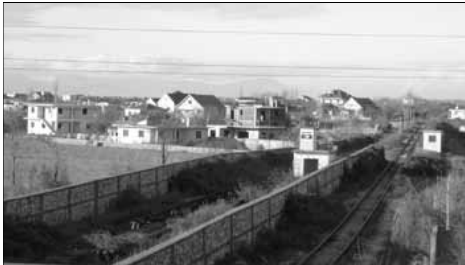
Fig. 4b Extension of the informal settlements Sl. 4b. Širenje neplaniranih naselja