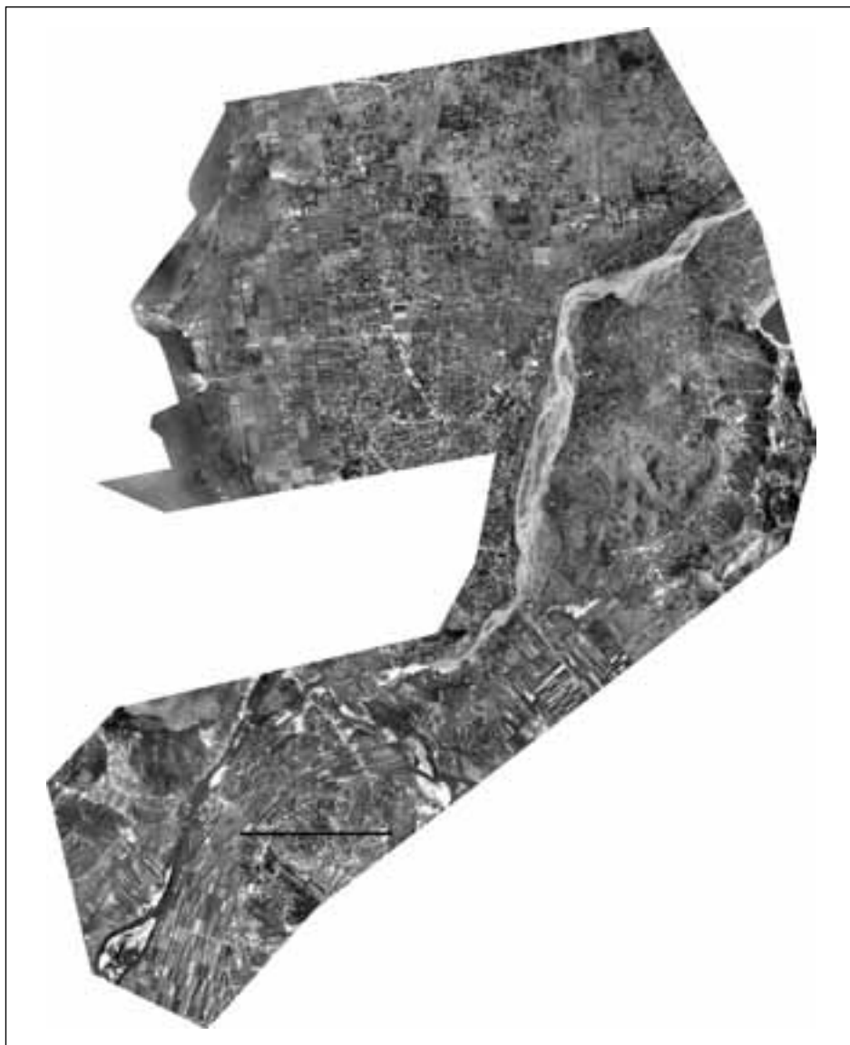
Fig. 3 Orthophoto map of the study area

Sl. 3. Ortofotografska karta promatranog područja