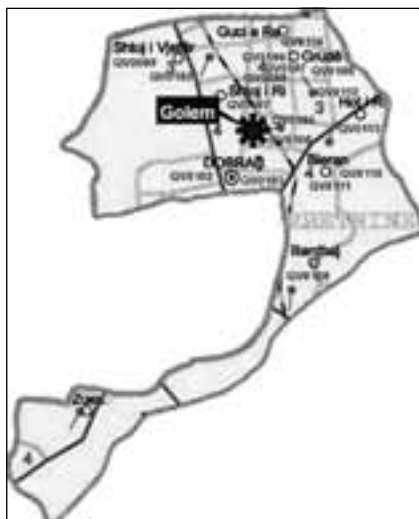
Fig. 1b Map of "Rrethinat" commune on the outskirts of Shkodër city Sl. 1b. Karta općine Rrethinat u predgrađu Skadra