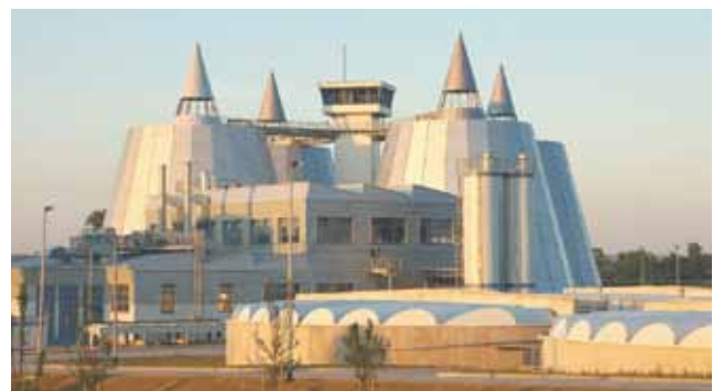
Figure 2. Sludge treatment (thickening, anaerobic stabilisation, dehydration)

Because the idea of simultaneous construction of the plant and the controlled disposal site seemed unsafe to authorities, it was finally indicated in the Invitation to Bid for construction of the CUPOVZ that the stabilized sludge, freed from surplus water, would be stored for the first two years at the temporary stockpile situated to be organized within the plant premises, Figure 2. It was consequently specified in Section 6.11 of the Concession Agreement that the city will provide at no additional cost a sludge disposal site, outside of the plant premises, and this until final acceptance of the plant at the latest. In case the City does not provide a disposal site outside of the plant premises, the Concessionary is authorized to organize and conduct appropriate sludge disposal and to charge the City a mutually agreed fee for such disposal.