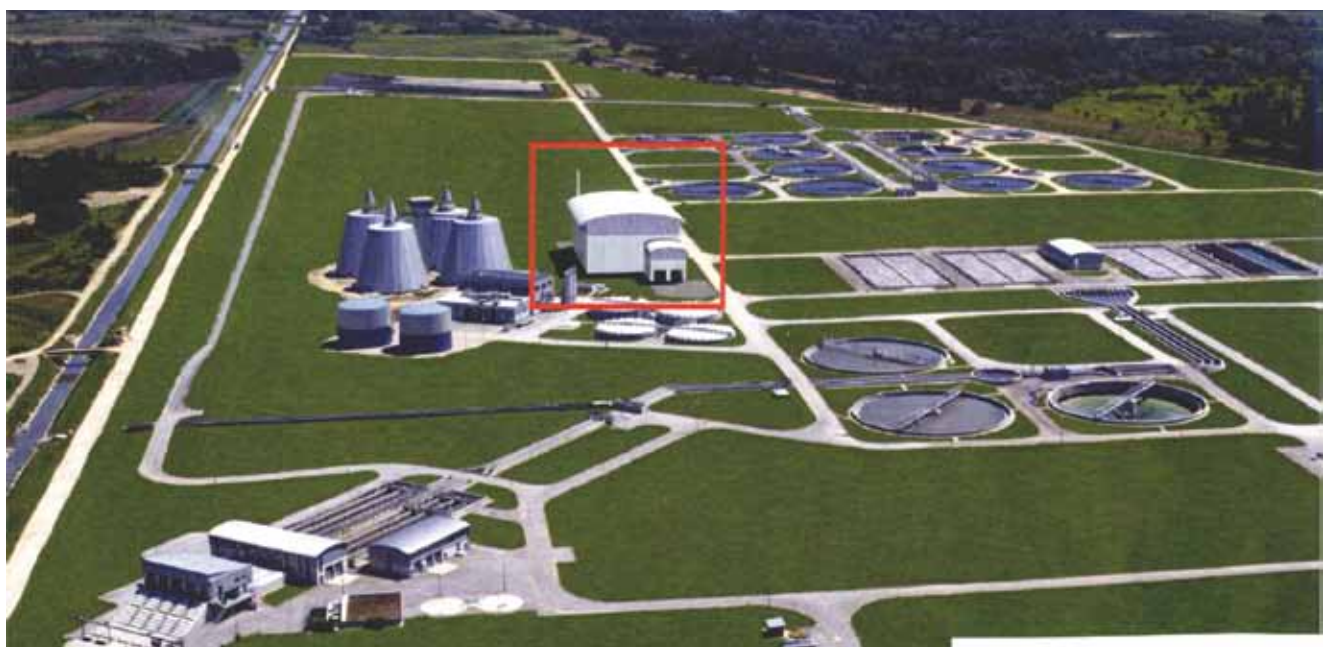
Figure 5. View of CUPOVZ with an area for thermal treatment of sludge marked in red

treatment of sludge . This study on the monothermal treatment of sludge comprises all activities that are needed for plant construction, including additional activities related to environmental protection [25]. The mono-incinerator would be located in the immediate vicinity of sludge stabilisation and dewatering facilities, Figure 5. The time needed for design preparation, procurement of necessary permits, and realization of civil engineering, mechanical and electrical works, would amount to about four years. As the decision on the final disposal of sludge has not as yet been made, it can easily be concluded that an unnecessary spending of considerable funds for the transport sludge to an external location is going