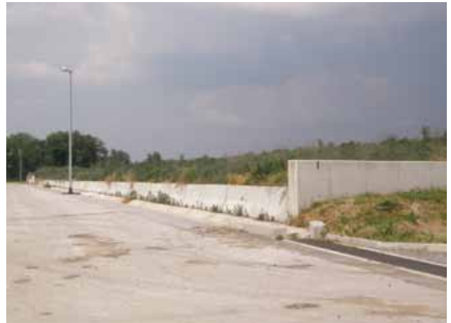
Figure 3. Temporary stockpile of stabilized and dehydrated sludge (at the plant premises)

Since 2007, an average quantity of 52,400 tons of sludge was stored at CUPOVZ premises every year. Based on available storage area within the plant, it is presently estimated that it will be possible to store sludge at CUPOVZ premises until the end of 2013, Figure 3.