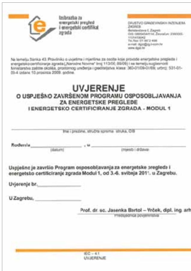
Figure 3. Example of certificate issued upon successful completion of training program (Society of Civil Engineers – Zagreb)

Some certificates, issued after successful completion of training programme by legal persons that have been approved to conduct such training by the ministry in charge of physical planning and construction, are presented in Figure 3.