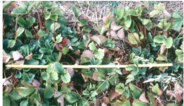
Figure 1. Wilting symptoms in strawberries infested by Verticillium dahliae ; wilting of the older, outer leaves; the young leaves remain stunted