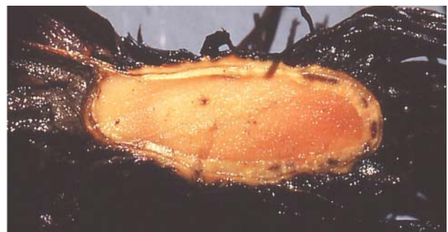
Figure 2. Section through the crown of a strawberry plant infested by Verticillium dahliae : as a result of the activity of the fungus in the xylem, the vascular bundle appears brown