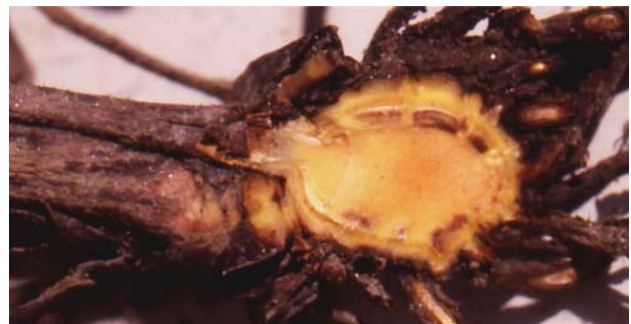
Figure 3. Discoloration in an advanced stage