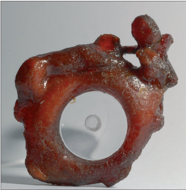
Sl. 1 Fig. 1

1989: 173–211; Gagetti 2000: 193–250; Gagetti 2001: 191–481).