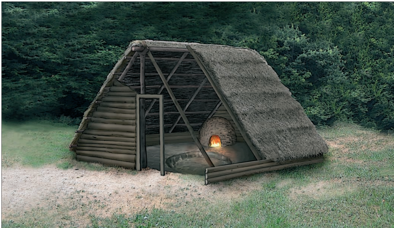
Sl. 2 Virovitica – Kiškorija jug, rekonstrukcija jednodoborne kuće SJ 1242 (crtež: Miljenko Gregl)) Fig. 2 Virovitica-Kiškorija jug, a reconstruction of single-room house SJ 1242 (drawing: Miljenko Gregl)

prostoru. Naime, površina stambenog prostora kuća na području Slovačke, Moravske i sjeverne Mađarske kreće se od 4 do 22 m 2 , s time da najveći broj objekata zaprima prostor od 7 do 11 m 2 . Za ostala slavenska područja prosječna kvadratura kuća iznosi 12 do 15 m 2 . U jugoistočnoj i istočnoj zoni slavenskog prostora evidentiran je najveći broj poluukopanih kuća s dva potporna stupa kvadrature od 9 do 12 m 2 , iako postoje primjeri i površinom većih objekata (Šalkovský 2001: 25, 44, Abb. 18: 2). Na području srednjeg Podunavlja površinom najvećim objektima pripadaju tipovi kuća s više potpornih stupova u konstrukciji stijena objekta (Ruttkay 2002: 271). Za naše krajeve u dosadašnjim sintezama nedostaju podaci te su nam u tom smislu rezultati istraživanja kod Virovitice od izuzetna značaja.