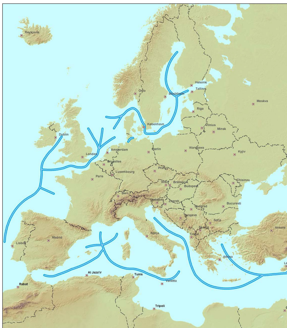
Zemljovid 1. “Morske autoceste” Map 1 The Motorways of the Sea