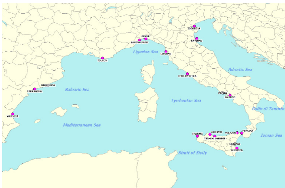
Zemljovid 2. Ecobonus relacije i luke Map 2 Ecobonus routes and ports