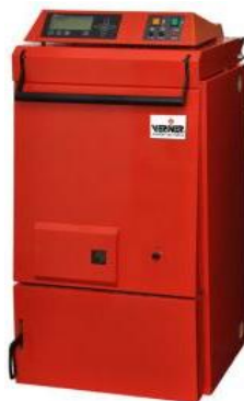
Figure 1. Lump wood boiler of VERNER V210 type

The developed model for the determination of nitrogen oxides, presented later in this article, is of general validity, but the constants A and B contained in it apply only to combusted wood with particular nitrogen content in it as its current calorific value. Therefore, if the other type of wood is combusted than wood burned during the guarantee measurements for the VERNER boiler (dry beech wood logs of length about 34 cm), it is necessary to re-establish the constants A and B appearing in the equation (17) of the developed model.