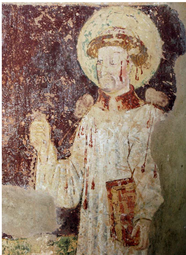
Picture 1. Vincent of Kastav, around 1474. St. Stephen the Martyr. Beram, The Church of St. Mary-on- the-Stone-Slabs.

Hagio-topography and hagio-chronology of the occurrences of the name of Stephen the Protomartyr in Istria.