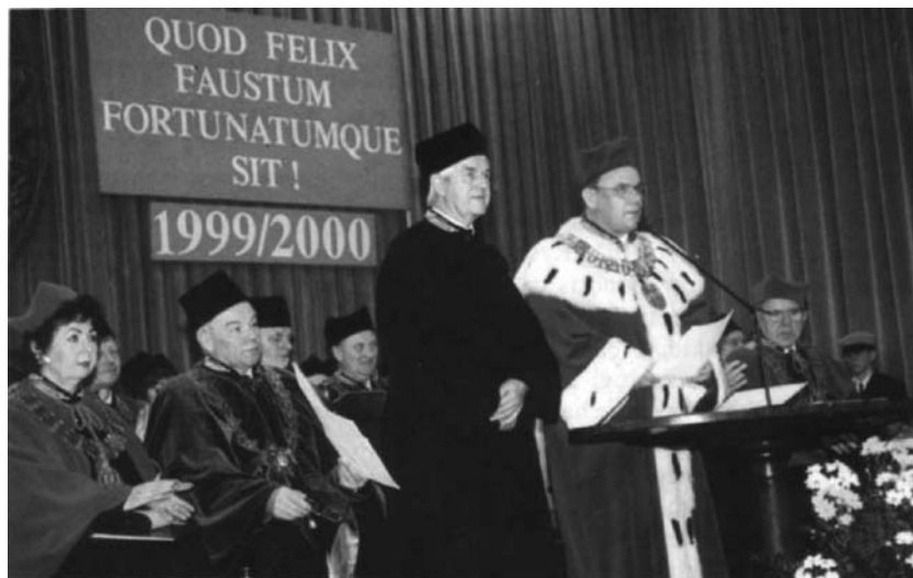
Poland 2000 – now are seats reserved not only for male professors