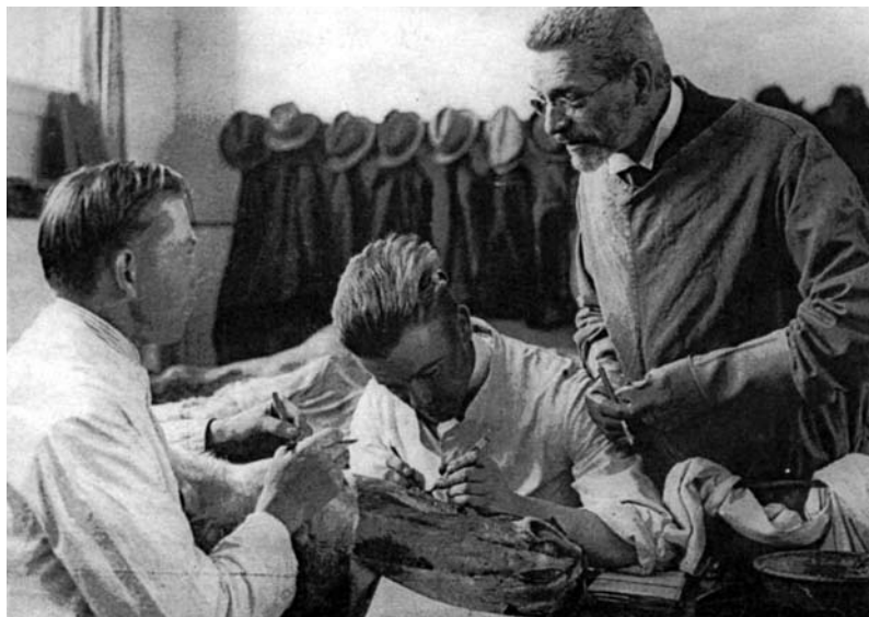
Copenhagen, around 1925, autopsy room at the Faculty of Veterinary Medicine with only male students