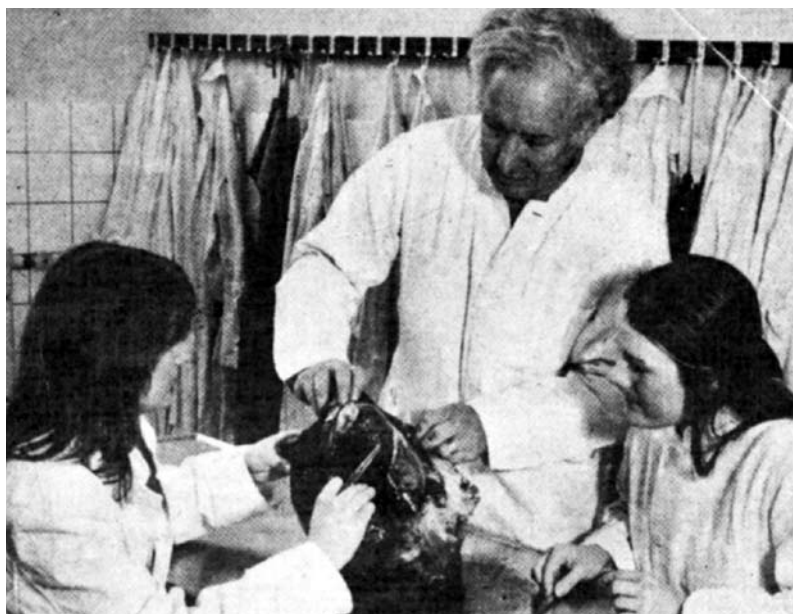
The same place some 40 years later: male hats disappeared and the room is filled with female students.