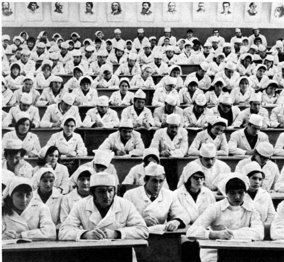
One of the lecture-rooms at the Faculty of Veterinary Medicine in Moscow, 1970s. Many students are women.