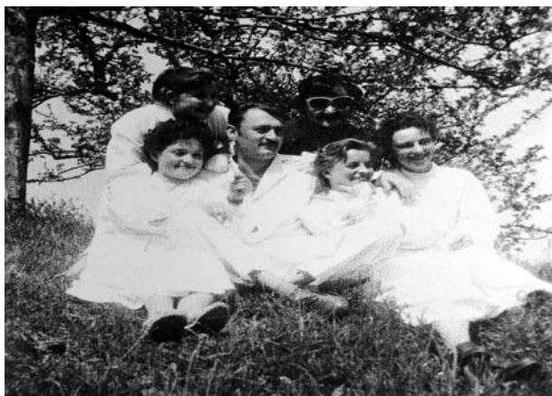
Fig. 5. Laboratory technicians in the Hospital garden on an idyllic spring day.

of plasma + 0.1 mL of thromboplastin + 0.1 CaCl 2 = turn on the stopwatch and at 37 degrees Celsius keep an eye on thrombus formation. Reagents for coagulation factors V and VII were made from cow blood, which was obtained from the Sljeme Slaughterhouse. Blood was filtered through the Saisor filter vacuum system and then the standard curve was determined. At that time, patients were taking oral anticoagulants, 100 mg Dicumarol tablets, 3 mg Marcoumar tablets and 30 mg Thromexan tablets, and the lowest PT therapy value was 20%. Heparin treatment was controlled by coagulation time on a small laboratory glass plate and by using the stopwatch. In case of Bürger's disease, technicians applied treatment with malaria. The attenuated and pretreated Plasmodium was ob-