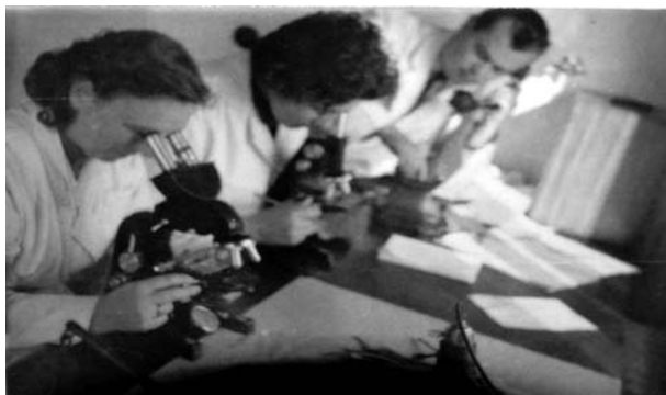
Fig. 3. Enthusiastic work of laboratory technicians.

Figure 2 shows specification of blood tests performed at Laboratory of Hematology in 1949, most of