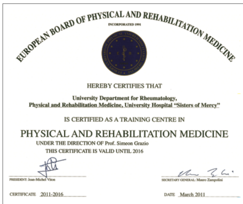
Fig. 3. Certificate Training Center EBPM.