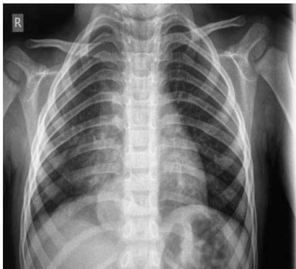
Fig. 1. Chest x-ray: ovoid shadow of about 4 cm in size and soft tissue density located supradiaphragmatically to the right.

Considering the finding of an aberrant artery from the abdominal aorta, which entered the lung paren-