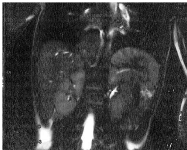
Fig. 2. Magnetic resonance imaging indicated herniation of a portion of the liver in the right thoracic base region, as well as an aberrant artery leading from the abdominal aorta and proceeding towards pulmonary parenchyma.