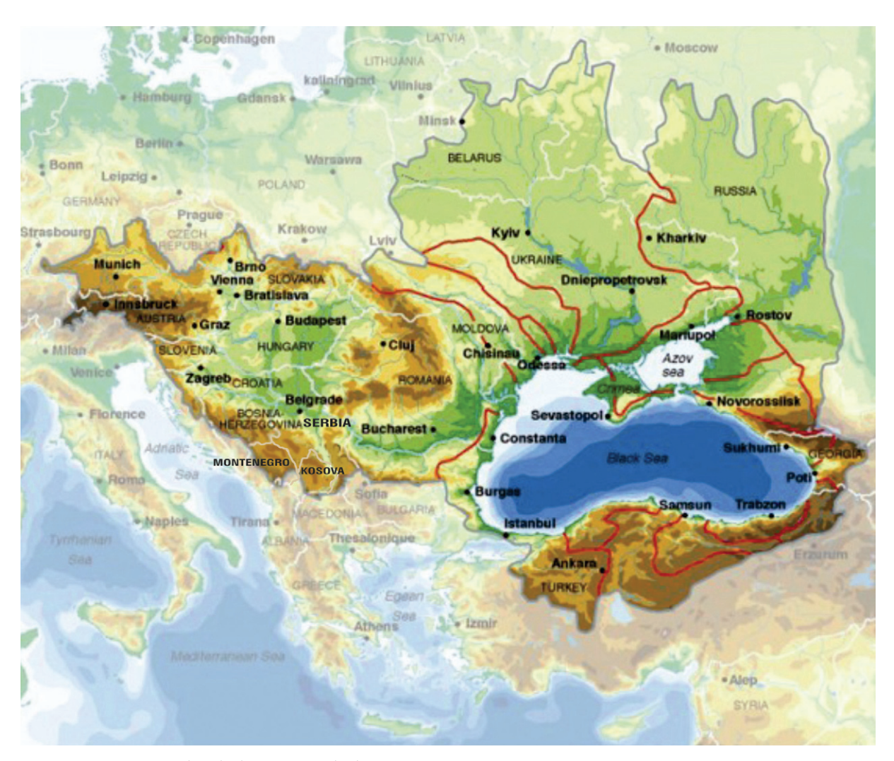
Figure 1 Countries in the Black Sea Watershed in 2012

The above mentioned coastal states, however, are hardly the only countries that use and affect Black Sea ecosystem resources. In addition to them, sixteen or seventeen countries - Albania, Austria, Belarus, Bosnia and Herzegovina, Croatia, the Czech Republic, Germany, Hungary, Italy, Kosovo (not recognized by the majority of UN Member States), Moldova, Poland, Slovakia, Slovenia, Switzerland, Serbia, and Montenegro - own parts of the Black Sea watershed (Fig. 1) and, therefore, need to be acknowledged as parties responsible for the sustainable management of the Sea.