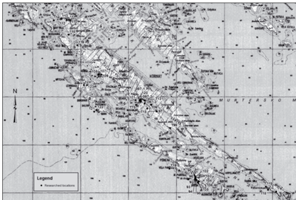
Figure 1. Researched locations in NP Kornati

Sampling locations were chosen according to the dominating habitat type, with the purpose of covering as many different habitat types as possible, in order to collect a more diverse spider fauna. The dominant habitat types were primarily olive groves, dry meadows and dry karstic pastures. The most represented habitat on the islands of NP Kornati is dry, stony karstic pasture. It is characterized by bare karstic rocks, with very scarce vegetation cover, dominated mostly by different grass species. The pastures are still used for grazing livestock, primarily sheep, but with very low intensity. Dry meadows on the islands are very similar to karstic pastures, but they are characterized with deeper soil and more diverse vegetation, again with dominating grasses. They are also used for livestock pasture. Olive groves are the only crops that are now grown at NP Kornati and represent the only areas now actively managed by inhabitants from the nearby coastal settlements.