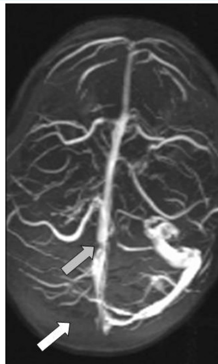
FIGURE 2. Brain magnetic resonance venography (MRV) showing no flow in the right transverse sinus and ipsilateral cortical veins (white arrow) and partially occluded flow in the superior sagittal sinus (gray arrow).

This case report presents difficulties in diagnosing the cause of postpartum headache in a patient who under-