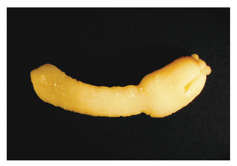
Fig. 1. Hepatoxylon trichiuri from the stomach wall of northern bluefin tuna (Thunnus thynnus)

Histological sections had erosions and deterioration of the mucosal columnar epithelium at the attachment site of the plerocercoids (Fig. 2). At sites where bothridial hooks penetrated the gastric glands,