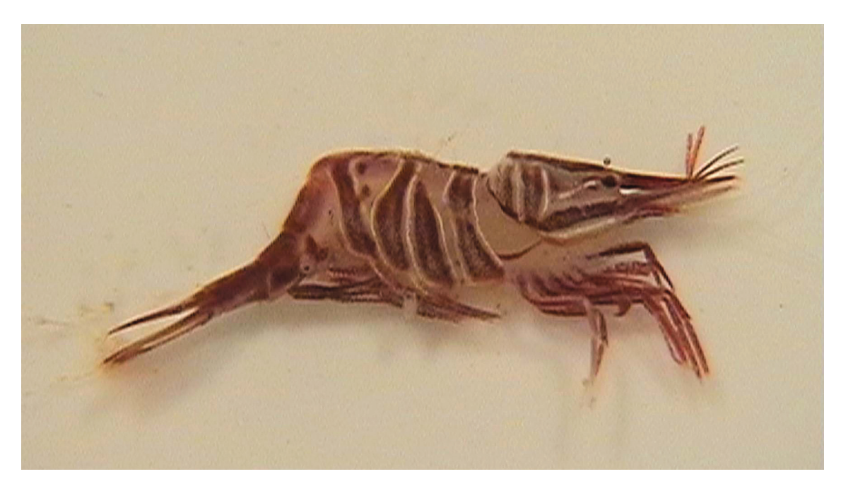
Fig. 2. Hippolyte prideauxiana Leach, 1817 (total length 24 mm), discovered in Stara Voda, Kostrena (northern Adriatic)