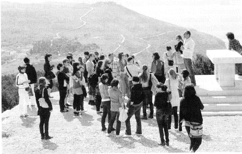
Studenti u posjeti kontroverznom projektu golf terena na Srđu / Students visiting a controversial golf course project on the mount Srđ above Dubrovnik