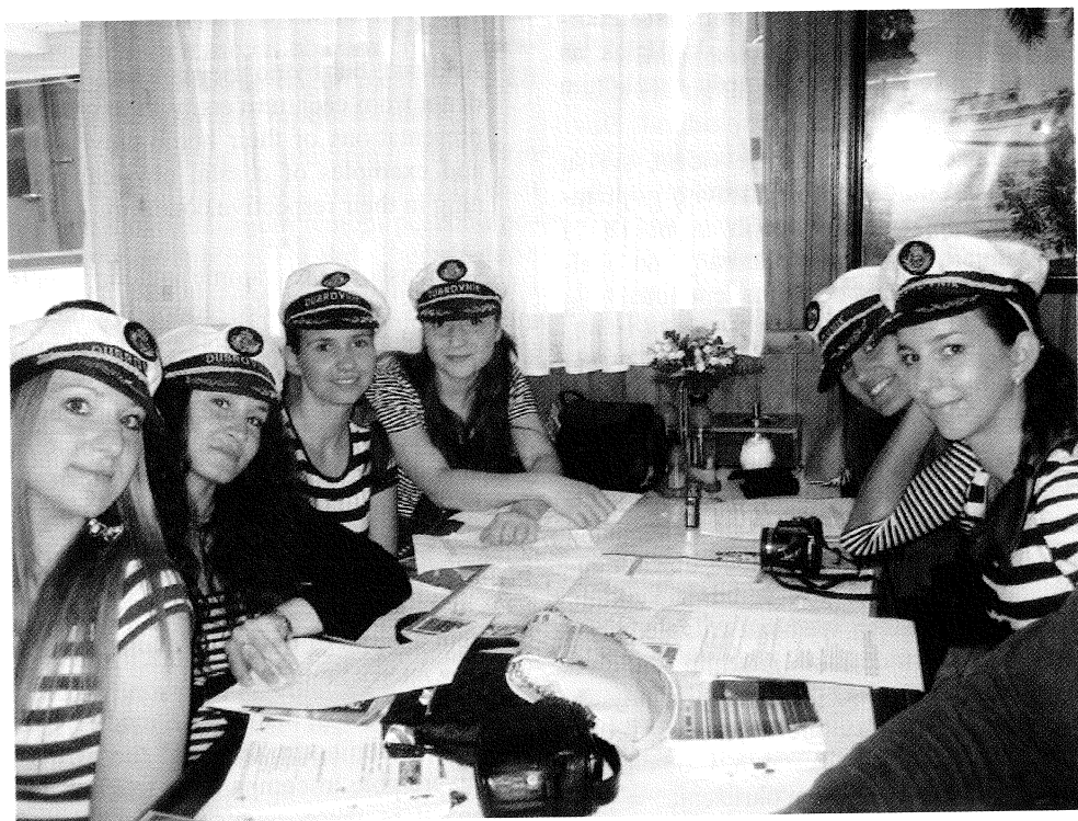
Studentice Ekonomskog fakulteta Zagreb u pripremi izlaganja programskog zadatka / FEB students preparing assignment presentation