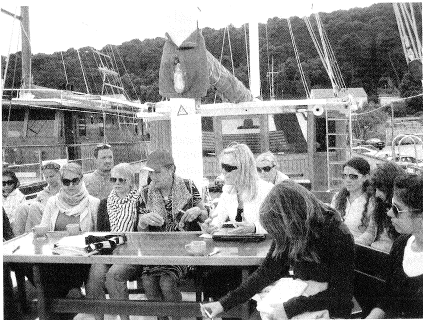
Zaključna radionica: Osvrt na viđeno i naučeno / Sum-up workshop: Reflecting on what we've seen and learned