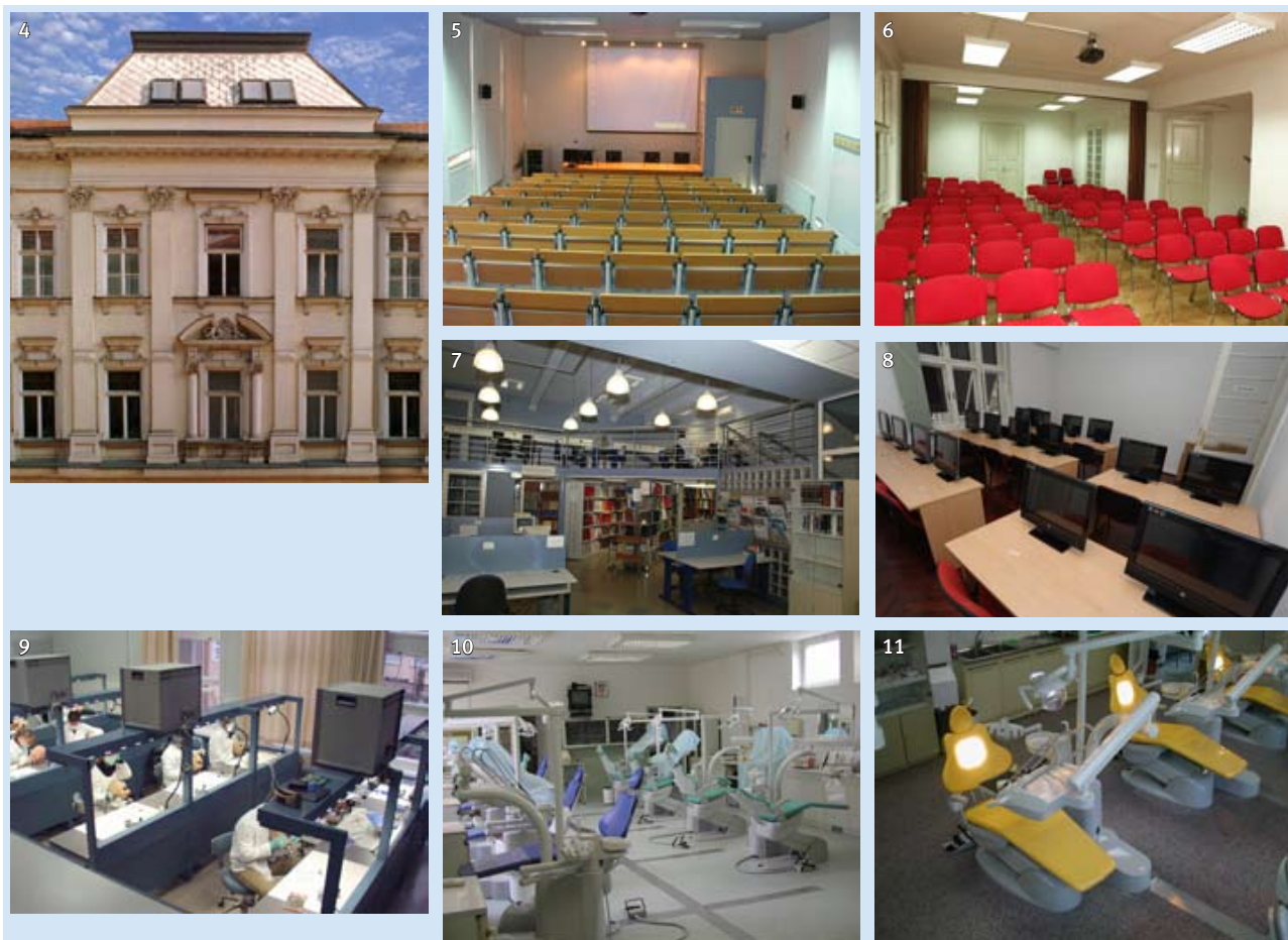
Slika 4. Pročelje Stomatološkog fakulteta u Zagrebu