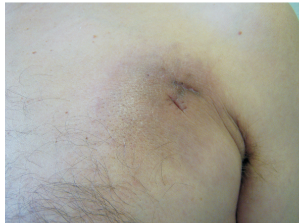
Figure 1. Skin lesion in the patient with SPTCL.

pectoral region, which was hard and tender on palpation, with a central postoperative 1-cm scar (Fig. 1). In his infraumbilical region, there were two 1.5-cm subcutaneous nodular lesions covered by erythematous-livid skin. Also, in his left preauricular region, there were similar skin changes of 1-cm in size. On the scalp, in the left retroauricular region, there was a 1.5-cm hairless area, with spared hair follicles and negative 'light pull' test.