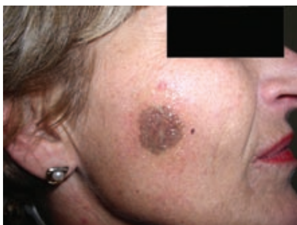
Figure 1. Solar lentigo lesion before the treatment with QSLR.

A 58-year-old woman with type II skin presented to our Department with uniformly a colored brown macule with sharply demarcated polycyclic borders, which persisted on her right cheek for about 30 years with slow progression. The size of the lesion was 20x17 mm (Fig. 1). There was no family history of skin diseases. The lesion was clinically evaluated as solar lentigo. However, according to the ABCD rule ( A symmetry, irregular B orders, C olor variegation, D iameter larger than 6 mm), the differential diagnosis included lentigo maligna. Therefore, biopsy was performed and histological analysis revealed thickened epidermis, papillomatosis and hyperpigmentation of the basal layer of the epidermis, which was consistent with solar lentigo. The lesion was treated with QSRL at a fluence of 2,5 J/cm 2 using nonoverlapping 5-mm spot size. After the first session, the lesion was partially lightened (Fig. 2), and the treatment was repeated with the same parameters 6 weeks later.