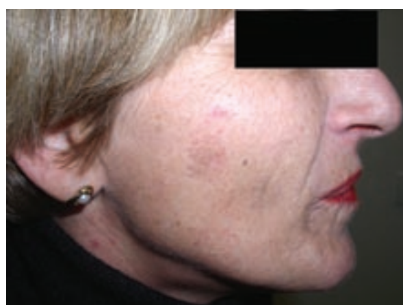
Figure 2. The result of one session with QSRL.