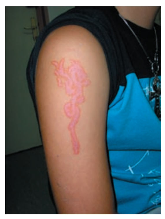
Figure 1. Marked redness at the site of tattoo application.

paraphenylenediamine (PPD) and thiuram (Fig. 2). Thereupon, the patient's mother reported that a year before, the boy had also had a temporary tattoo that had resulted in a "nodule" at the site of application a few days later, and had regressed spontaneously.