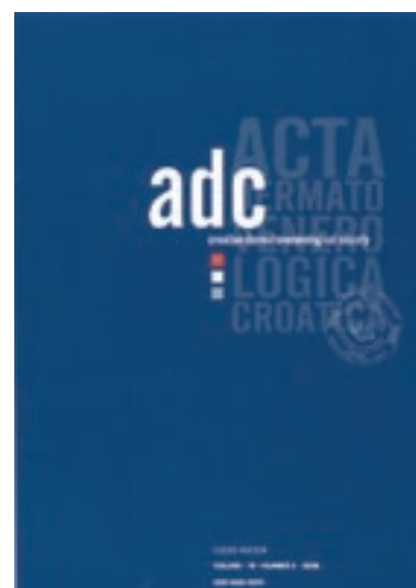
Figures 1-3. Historical advances in image of the ADC.