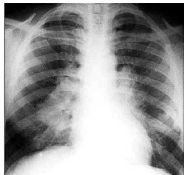
Figure 5. Chest radiography showed bilateral hilar lymphadenopathy.

Oral corticosteroids are the mainstay of therapy in sarcoidosis (2). It should be reserved for severe inflammatory disease of the eye, pulmonary and cardiac involvement, central nervous system