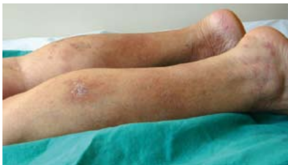
Figure 1. Erythematous subcutaneous nodules on the calves.

she was febrile but free from acute distress. Eye examination revealed findings typical of keratoconjunctivitis. Laboratory testing revealed a high erythrocyte sedimentation rate, elevated liver enzymes, serum angiotensin converting enzyme and alkaline phosphatase. Antinuclear antibody (ANA), antineutrophil cytoplasmic antibody (ANCA) and tuberculin skin test were negative. Complement levels, serum calcium and 24-h urine calcium levels were also within the normal limits.