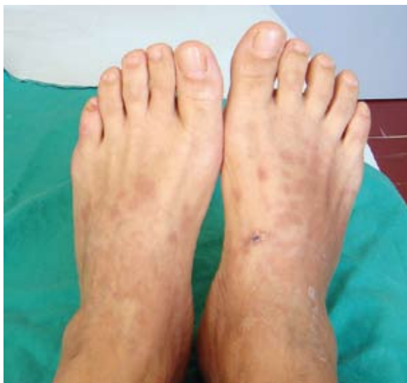
Figure 2. Maculopapular rash on the dorsal aspects of the feet.

HLA B8, A1 and DR3 have been associated with the presence of EN and spontaneous resolution of the disease (7). HLA DR17 has been associated with acute onset of the disease and Löfgren's syndrome (8).