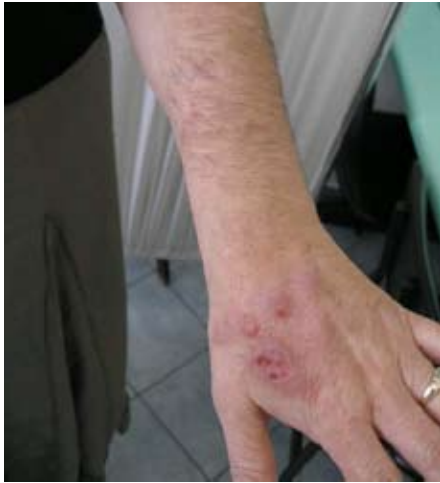
Figure 2. Classic clinical presentation of a patient with porphyria cutanea tarda.

reduced by 50%, although the structural protein is present. In extrahepatic locations, the enzyme structure and function are normal (17-19).