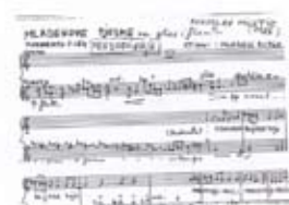
Figure 4. Lyrics of Mladen Rupec, illustrated by Ivan Lacković-Croata and Renate Brühl, and composed by Miroslav Miletić.