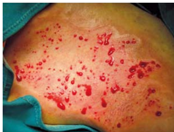
Figure 3. Recipient area.

From January 2007 to February 2008, we enrolled 15 patients (six men and nine women) for the clinical trial. Demographic and clinical characteristics and outcome for both groups are summarized in Table 1. Five (33.3%) patients had paternal family history, three (20%) had maternal family history, and seven (46.6%) had no family history of vitiligo.