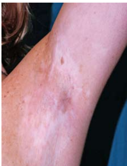
Figure 5. Postoperative view at 2 years without sun exposure.

Since 1987, there have been many reports on transplantation of cultured autologous melanocytes (9,10). As it involves in vitro multiplication of cells, the use of various culture media is obligatory. Culture techniques require a state-of-the-art laboratory, highly trained staff and at least two visits by the patient, and are quite expensive. As such, they are restricted to very specialized centers and are mainly useful for research purposes. Subsequently, the culture technique was modified by eliminating the step of in vitro culture of melanocytes, and cells were transplanted directly onto the affected depigmented area (11). The use of the