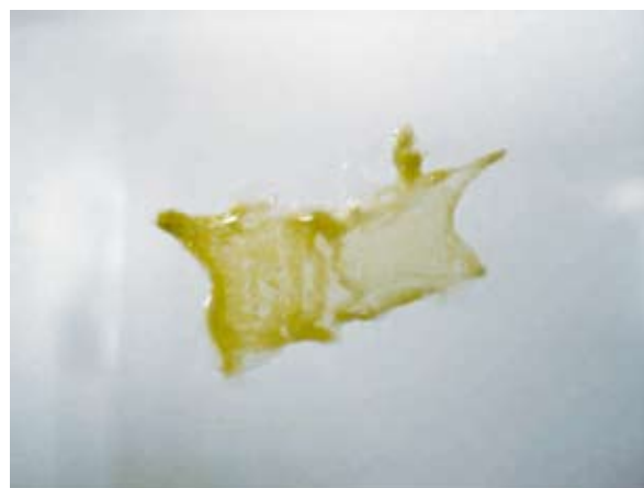
Figure 2. Separation of the epidermal layer from the dermis.

A thin split-thickness cutaneous biopsy (0.2-0.3 mm) was harvested from an uninvolved area using a Zimmer dermatome (Zimmer, Indiana, USA). According to the manufacturer's instructions, as the cellular spread rate is 1:80, the biopsy area was 1 cm 2 when the recipient area was 80 cm 2 and 4 cm 2 when the recipient area was 320 cm 2 . The epidermis was put in 4.5 mL of trypsin solution for 20 min at 37-38 °C to begin the intercellular detachment. While the biopsy was processed, classic escharotomy was applied on eschars of vitiligo and deep partial thickness areas with thick fibrin slough. Upon completion of digestion with trypsin, the epidermis was separated from the dermal layers and epidermal cells were further divided with the scalpel blade. Cells were further suspended in