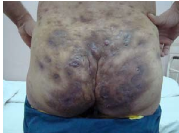
Figure 6. Steatocystoma multiplex suppurativa - acne conglobata like

ing like hidradenitis suppurativa (Fig. 5) and acne conglobata (Fig. 6). The rest of the lesions were intact. Laboratory results showed elevated inflammatory parameters with marked leukocytosis. Bacteriology pointed to Staphylococcus aureus superinfection. Histologic examination of these inflamed lesions showed granulomatous inflammation with lymphocyte infiltration and necrosis (Fig. 7). The diagnosis of steatocystoma multiplex generalisata partially suppurativa was made. The patient was treated with oral isotretinoin (1 mg/kg daily) for 14 weeks and antibiotics. Based on the antibiotic sensitivity report, a combination of cefuroxime and gentamicin was administered for 14 days. At the same time, topical antiseptics, anti-inflammatory agents and antibiotics were applied. Cryotherapy was used for small, non-suppurating lesions. The lesions healed slowly, with local disfigurement, hyperpigmentation and unpleasant scars. At the time of writing this report, the patient is on therapy with oral isotretinoin 0.5 mg/kg daily.