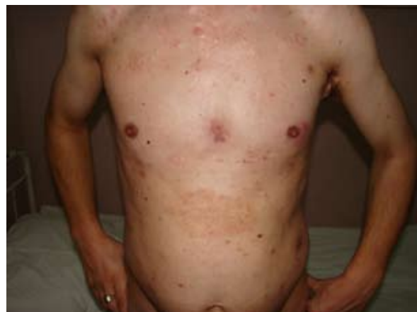
Figure 3. Lesions on the trunk, café au lait spot and naevi

A 27-year-old male patient, under our observation for five years, had been presenting since the age of 8 with multiple, asymptomatic, round-to-oval, well-defined, smooth-surfaced, yellow to skin-colored, 5- to 22-mm diameter cysts and nodules initially scattered on the trunk and lately disseminated all over the body, with less lesions on the lower extremities (Figs. 1 and 2). Hyperpigmented, smooth, shiny plaques were also present on the upper back. There were no nail changes. We also found a giant café au lait plaque situated centrally on the abdominal region and more than