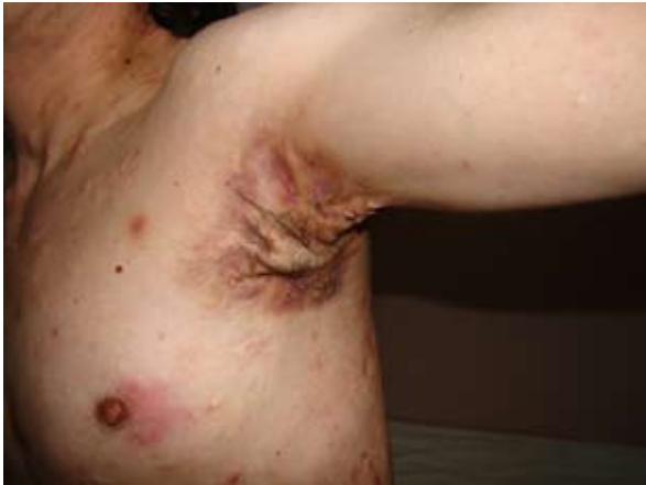
Figure 5. Steatocystoma multiplex generalisata suppurativa - hidradenitis-suppurativa-like axillary on left side