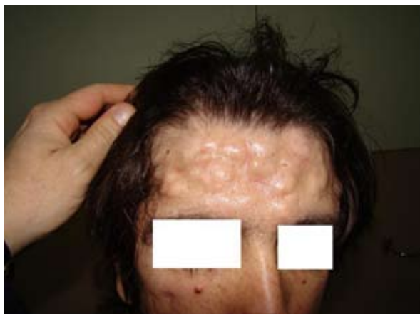
Figure 1. Lesions on the face

multiplex is a benign disorder, but in some patients the severe inflammatory variant, steatocystoma multiplex suppurativa , may appear. In such cases, secondary bacterial colonization often leads to malodorous discharge. These lesions could heal with local disfigurement or with the appearance of cosmetically unpleasant scars.