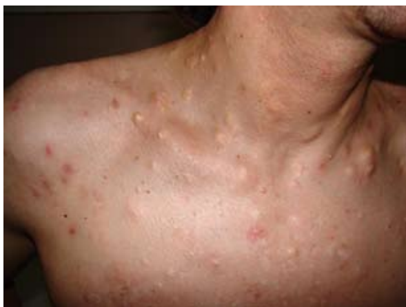
Figure 2. Lesions on the upper chest and neck

multiplex is a benign disorder, but in some patients the severe inflammatory variant, steatocystoma multiplex suppurativa , may appear. In such cases, secondary bacterial colonization often leads to malodorous discharge. These lesions could heal with local disfigurement or with the appearance of cosmetically unpleasant scars.