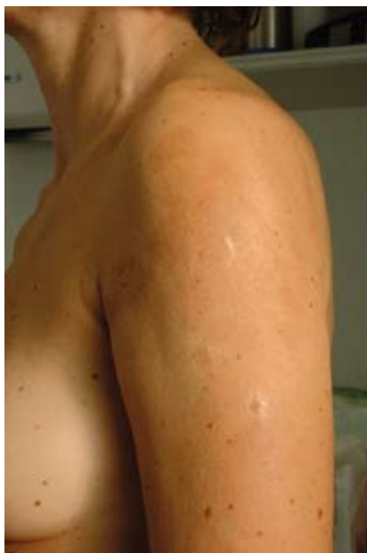
Figure 3. The condition after three months of treatment: plaque regression and slight pigmentation.