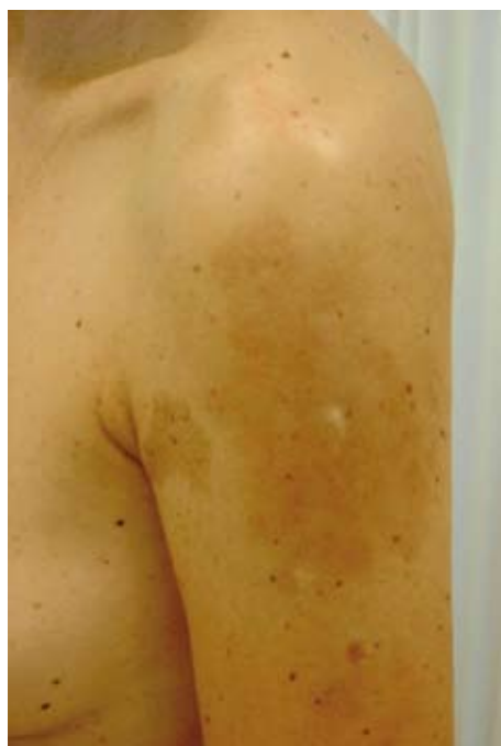
Figure 1. Atrophic, hyperpigmented, telangiectatic plaques on the left arm.

Clinical examination revealed atrophic, hyperpigmented, telangiectatic plaques, with no tendency to become confluent or cause joint contractures (Fig. 1). Histology showed thickened collagen bundles with fibrosis, mainly in reticular dermis, fibrosis of adnexal structures, and a moderately severe inflammatory infiltration between collagen bundles and around blood vessels. Collagen fibers