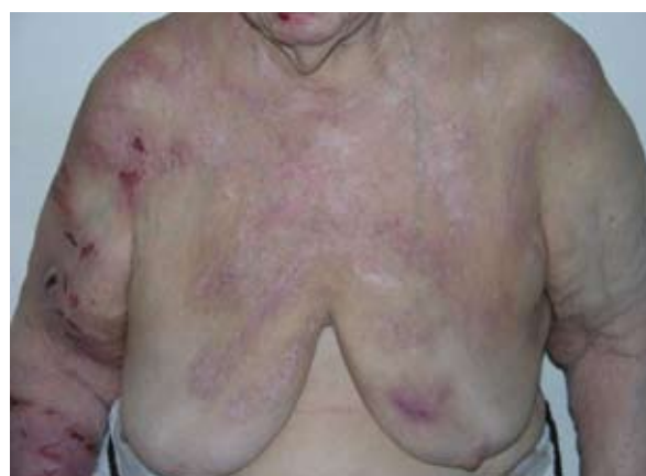
Figure 3. Deep ulcerations on brachial part of right arm.

ical problem. Women are most affected, as happens in other psychiatric pathologies related to dermatitis artefacta, such as depression, obsessive compulsive