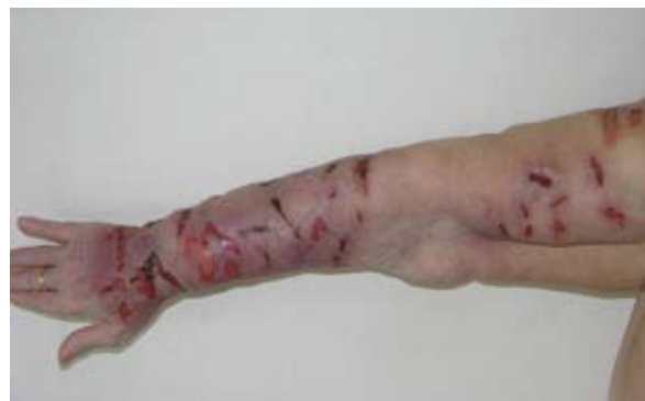
Figure 2. Deep ulcerations on right arm.