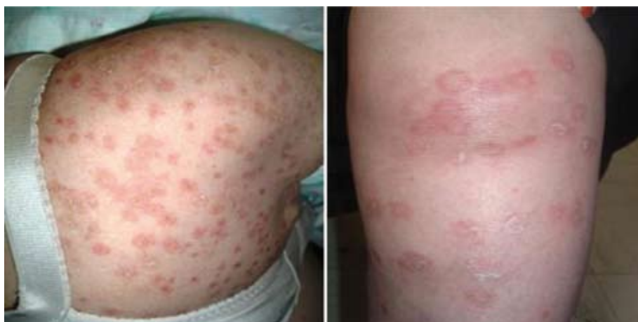
Figure 2. Erythematous, well demarcated round plaques with scaling and pustules on the back and arm.

Generalized dermatophyte infections of the skin are typically observed in immunocompromised patients (e.g., patients receiving long-term immunosuppressive therapy, patients with HIV infection or with underlying lymphoproliferative disorders) (5). There are a few descriptions in the literature of widespread tinea corporis in immunocompetent patients (6), but there are some reports of widespread and chronic