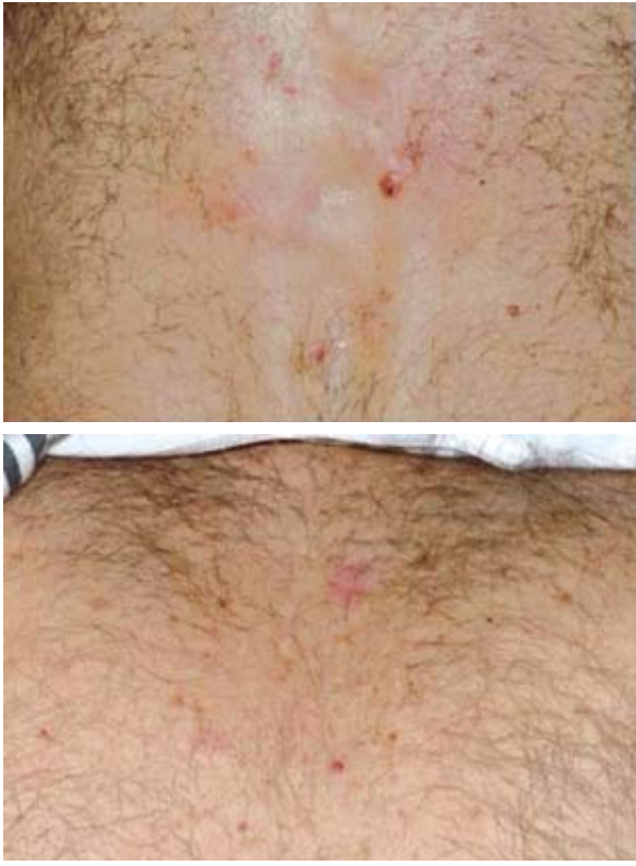
Figure 3. Total improvement of the lesions accomplished with 0.1% tretinoin cream after a month.

nuclear receptors RARs (retinoic acid receptors) or RXRs (retinoic X receptors) in cells and regulate gene expression by inhibiting transcription factors such as AP-1, which is a transcription complex controlling response to mitogenic injunctions (12). Retinoids also possess anti-inflammatory effects and they are shown to inhibit leukocytes, pro-inflammatory cytokine release and transcription factor expression (13). Topical retinoids are preferably used for localized cutaneous diseases for their low percutaneous absorption, rapid elimination and minor side effects. There are other local treatment options reported for Darier's disease including 5-FU, cryotherapy and photodynamic therapy, which obviously are not equally cost effective when compared to short-term topically applied retinoids (14,15).