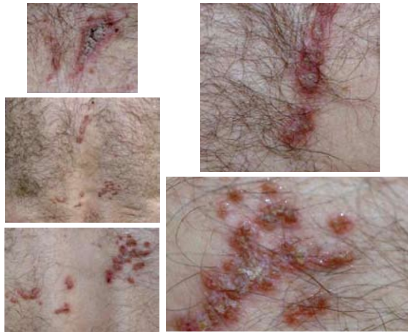
Figure 1. Hyperkeratotic papules in linear and zosteriform configurations located on Blaschko's lines over the back are seen on the left, and pinkish crusted papules seen on closer examination on the right.

for 6 weeks treated the disease successfully (3). In our experience, topically applied 0.1% tretinoin cream was also able to treat the lesions after twice a day application for 4 weeks.