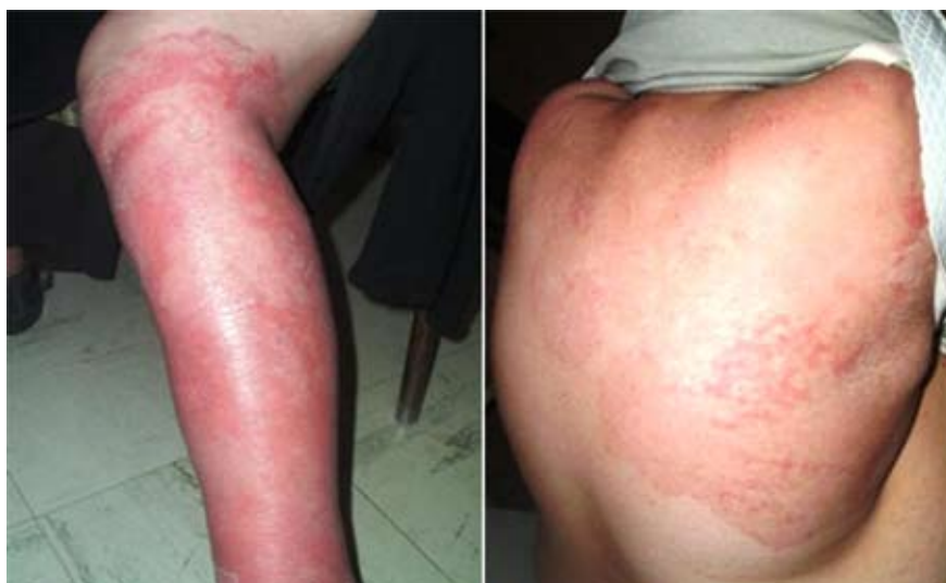
Figure 1. Erythematous, sharply demarcated lesions on the leg and back, with active margin and scaling surface.

Two weeks after ending the treatment course, the patient presented again to one of the above-mentioned dermatologic centers. They suspected pustular psoriasis and decided to start therapy with methotrexate. Before starting the new treatment, the patient presented to our dermatologic clinic. On physical examination, previous lesions were found to have changed to well-demarcated and round plaques with scaling and pustules on the back, face, arms, and right leg (Fig. 2). KOH smear and fungal culture indicated the diagnosis of T. rubrum dermatophytosis again, thus the previous 4-week course of fluconazole was reintroduced. After four weeks, complete resolution of all lesions was observed. Six-month follow up was normal.