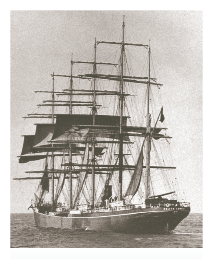
'R.C. Rickmers' as 'Neath'.

In the shadow of the celebrated schoolships of 'Gorch Fock'