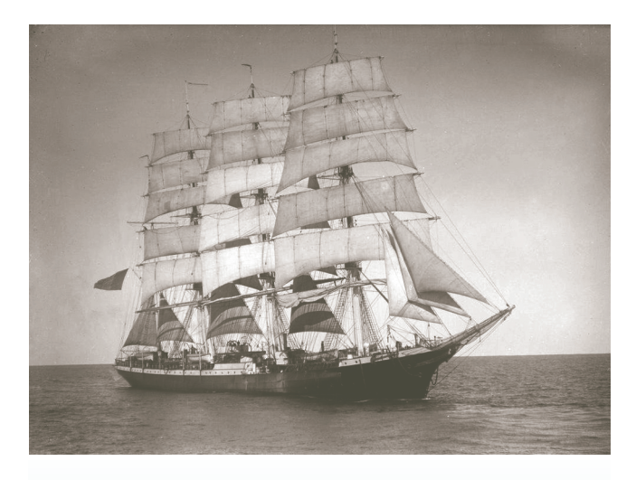
'L'Avenir' was lost as 'Admiral Karpfanger'.

Four years later from Tecklenborg yard at Wesermunde came the first newbuilding, 5-masted full-rigged ship 'Schulschiff Deutschland'. She kept sailing until 1939 on overseas routes