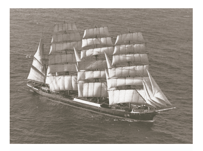
Ill-fated 'Pamir' in her better days.

In 1936 Norddeutscher Lloyd acquired 4-masted steel barque 'Magdalene Vinnen' of 3.476 GRT, built in 1921 by famous