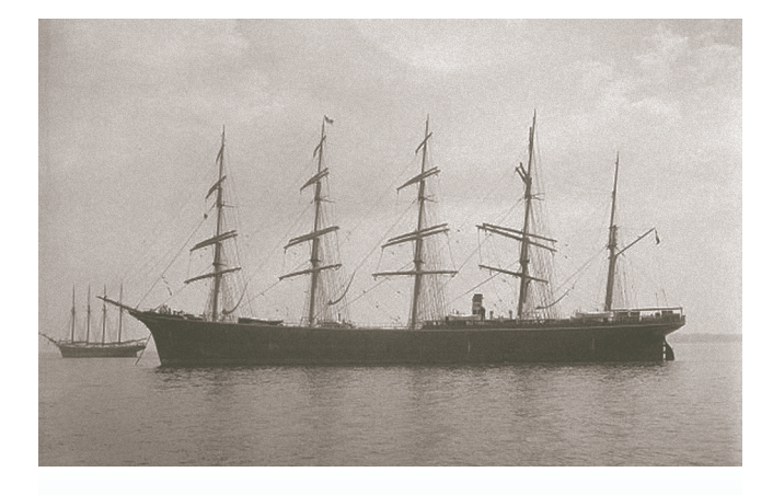
The biggest ever - 'R.C. Rickmers'.

1913-built steel hull schooner. Originally she was Danish vessel 'Morten Jensen'. Rebuilt into a 3-masted barque she was christened 'Niobe' in the memory of previous Prussian training vessel.