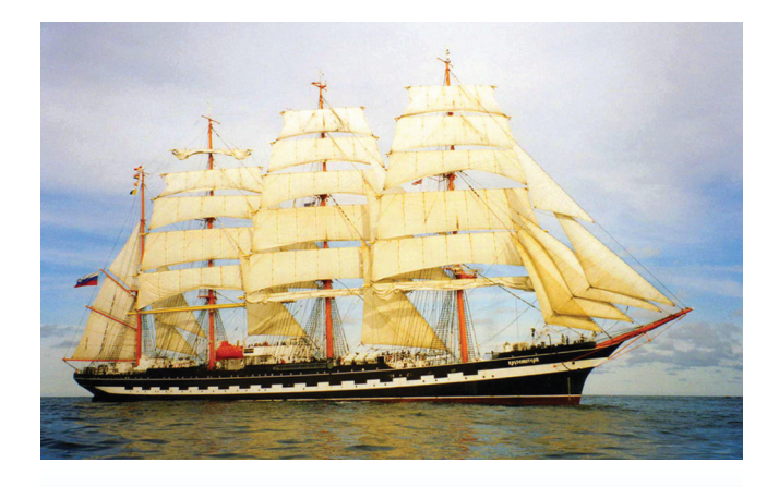
'Padua' as Russian 'Kruzenshtern'.

But at the beginning of 1920's Laiesz company managed to bring back six ships, including the 'Pamir'. In 1931 she was sold and became a part of famous Finnish 'grain fleet' operated