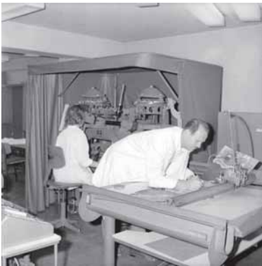
Once ... Nekad ...

On November 16 of 1961, the Executive Committee of the Parliament of the Republic of Croatia adopted the Regulation about the Organisation of Geodetic Service and decisions concerning establishment of the Zavod za fotogrametriju in Zagreb and the Zavoda za izmjeru zemljišta in Zagreb, Osijek, Rijeka and Split. It is soon going to be the 45th anniversary of the Zavod za fotogrametriju existing with the same name and at the same address. The Zavod za izmjeru zemljišta in Zagreb ceased to exist in the meantime, while the others, former Zavod za izmjeru zemljišta still exist and successfully operate as Geodetski zavod , in Osijek, Rijeka and Split.