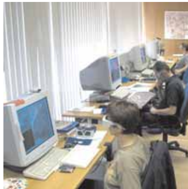
... Today ... Danas

Upon establishment, the Zavod za fotogrametriju accepted into working relationships geodetic professionals and other staff of the Office for Triangulation and Levelling in Zagreb, therefore triangulation and levelling work, besides photogrammetric work, presented the most